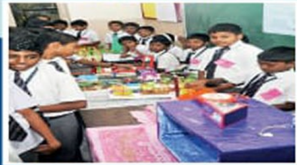
Science Project Concepts Developed and Presented by Students with help of teachers. Involve.